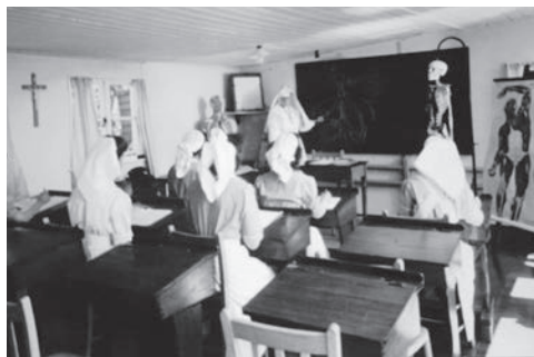
Above: This photo was taken at St. Anthony's Hospital although the school room at Holy Cross would have looked very similar. There were many resident nurses and students at the time and they made a lively social life for themselves. There are accounts of concerts, plays and other entertainments.

Facilities for physiotherapy and occupational therapy were added. During the 1960s, the Sisters took on the palliative care of cancer patients who had received treatment at St. Luke's Hospital in Guildford.