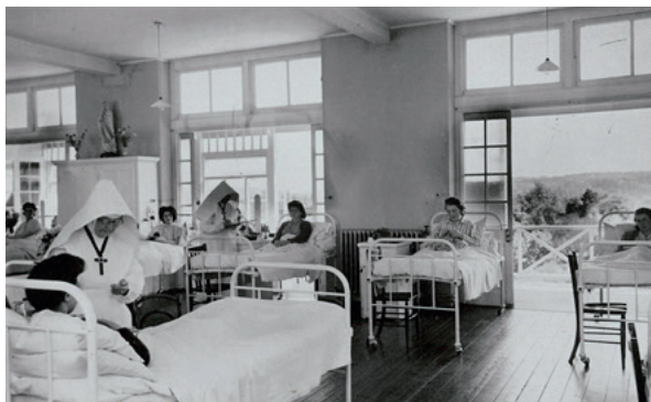
Left: By modern-day standards the wards were spartan. It was the 1960s before the newly formed Friends of Holy Cross raised money to buy curtain divisions for between the beds.

Right: Some patients recovered and went home having responded well to the nursing provided by the Sisters