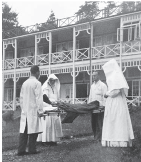
Above: A patient arriving at the sanatorium is greeted by Sisters. This was how on 21 February 1918, the first 50 patients arrived after a long and tiring day travelling by train from Ramsgate, Kent to Haslemere Station

Women and girls from the local boroughs and London County Council were cared for by Sisters and people employed from the local community.