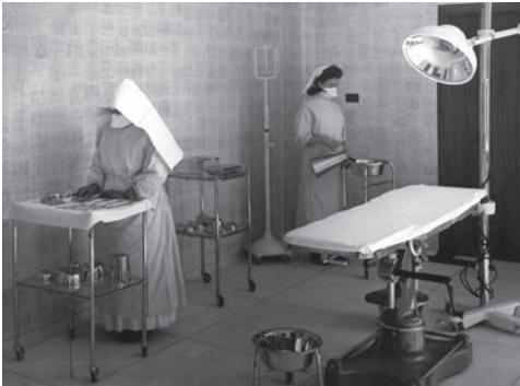
Above: The operating theatre was originally built as a treatment room for TB patients as in this picture but was adapted for use in the 1950s for a variety of surgical specialities.

At the end of the 1970s, the new Royal Surrey County Hospital in Guildford opened. In 1985, Holy Cross Hospital's surgical and terminal care beds ceased to be funded leaving neurology as the main work of the Hospital. In 1988 the Guildford authorities decided to withdraw that funding as well.